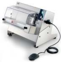
Optional pedal control