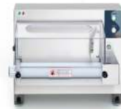
P-Roll 320/1 Plus