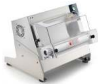
P-Roll 320/1 Plus