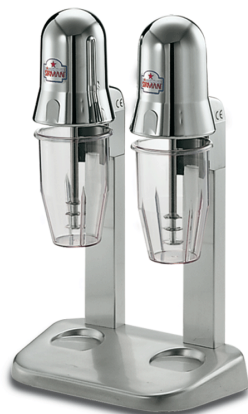
Sirman Drink Mixers , model Sirio 2 :

Sirman Spa Viale dell'Industria 9/11 35010 PIEVE DI CURTAROLO (PD), Italy Tel./Fax. +39 049 9698666 / +39 049 9698688 email: info@sirman.com