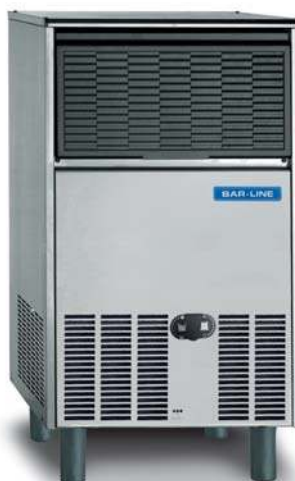
B 6022 AS/WS

Bar Line Equipment range is the newly released EU made ice makers for Thimble-shaped rounded ice cubes coming from Bar Line.