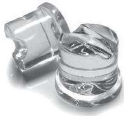
B 6022 AS / WS

Also available in the self-contained range for "Bistrot" cube: B 2006, B 2508, B 3008, B 3015, B 4015, B5022, B 7540, B 9040, B 9550 See pertaining literature for more details