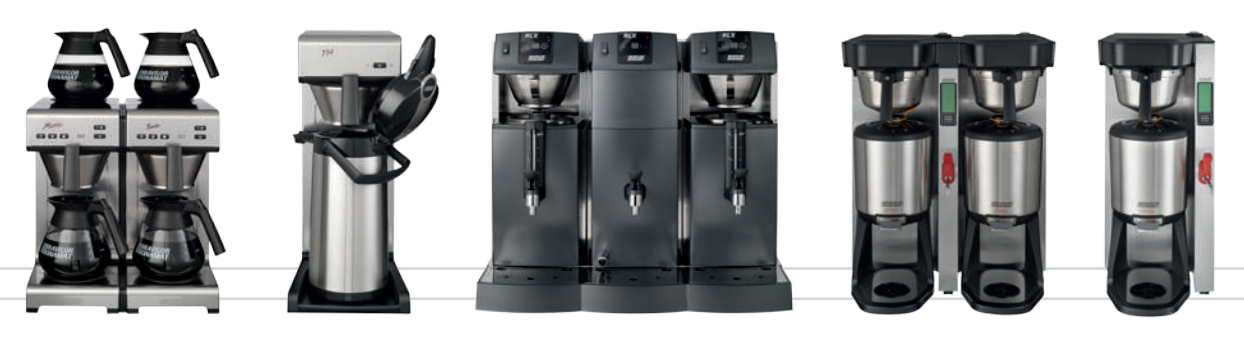
Quick filter machines | Table-top machines | Thermal brewers