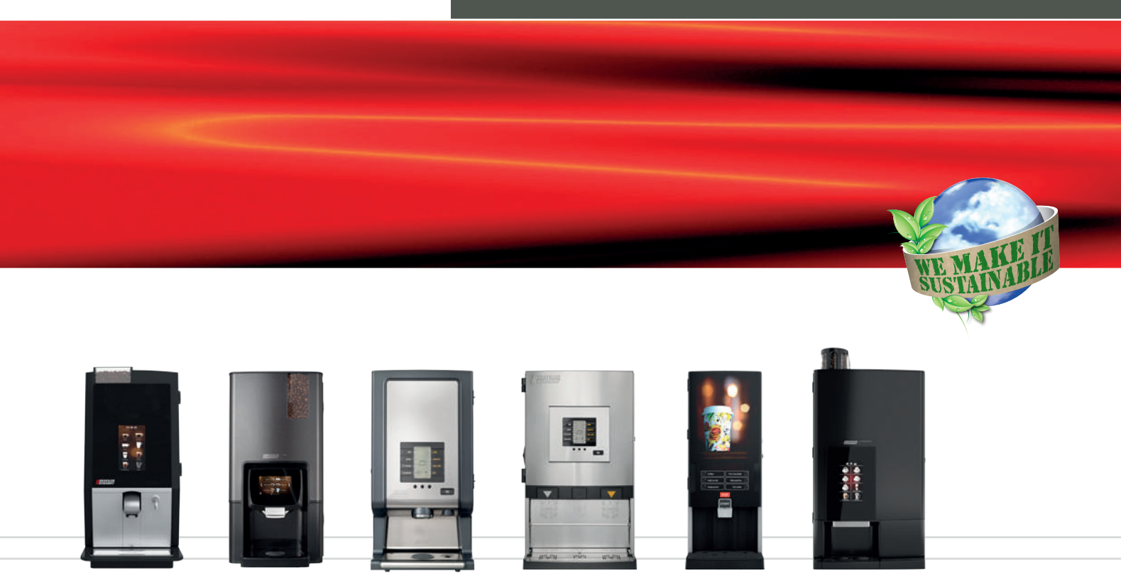
Espresso machines | Machines for instant ingredients | Liquid machines | Fresh brew machines