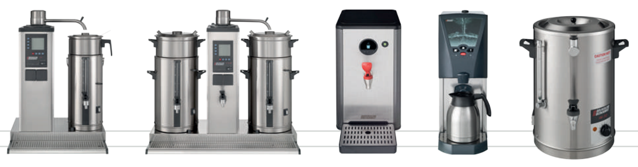
Round filter machines | Hot water machines | Milk heaters