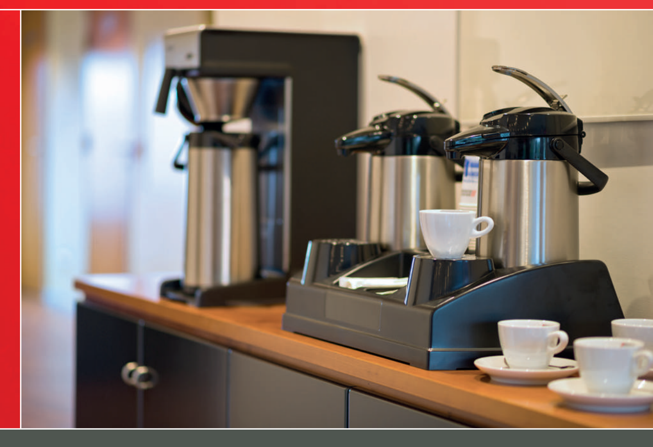
The taste of quality worldwide